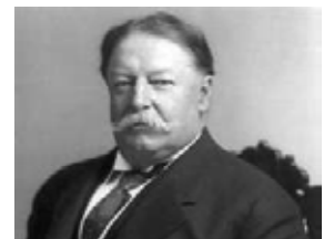
William Howard Taft Born - September 15, 1857 27th President of the United States of America