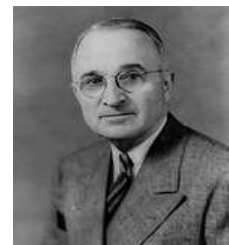
Harry S. Truman Born - May 8, 1884 33rd President of the United States of America