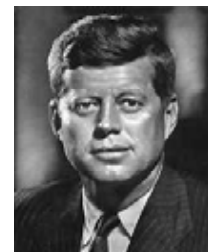
John F. Kennedy Born - May 29, 1917 35th President of the United States of America

Every Thursday at 1:00 pm. Bring your portable craft (knitting, crochet, embroidery, jewelry making, etc.). We work on our own projects and also donate items to local charities (Orlando Health, Orlando Rescue Mission, etc.). Join us!