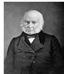
John Quincy Adams Born - July 11, 1767 6th President of the United States of America